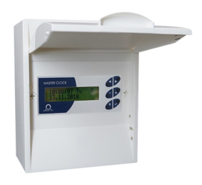
design IP 40